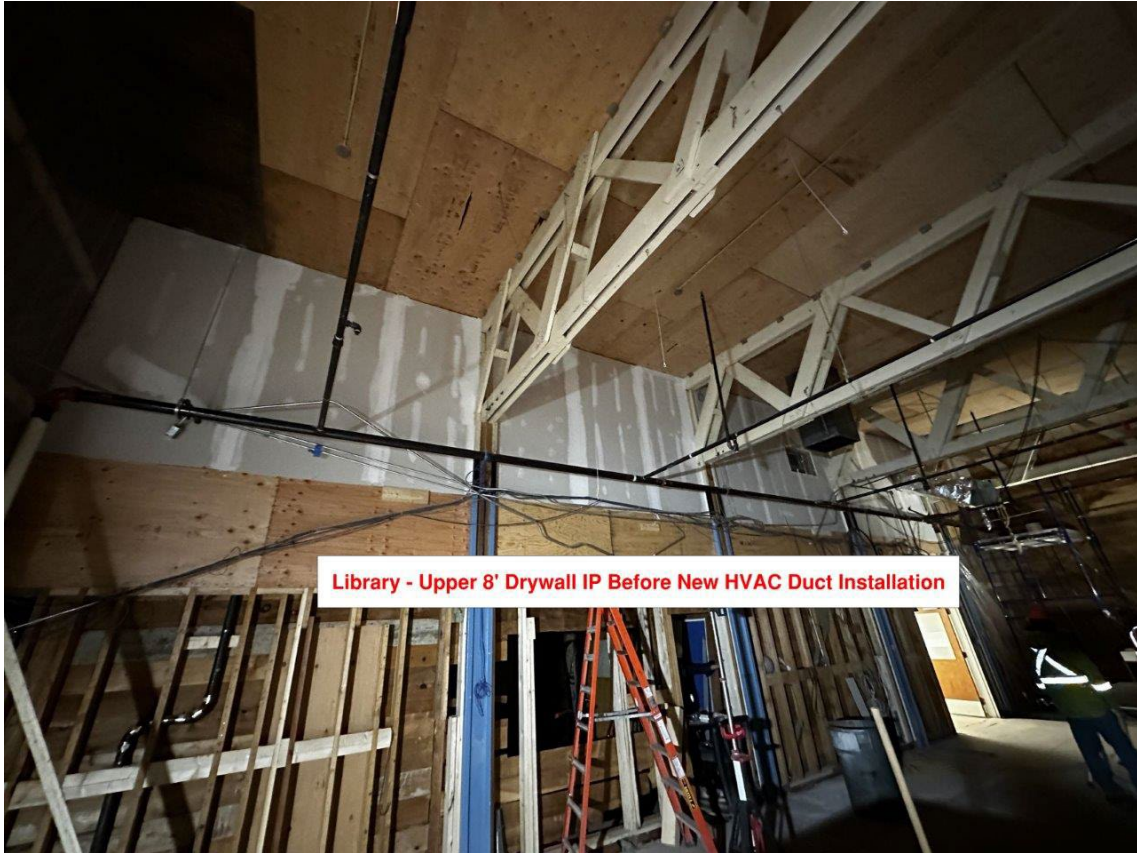
Library - Upper 8' Drywall IP Before New HVAC Duct Installation