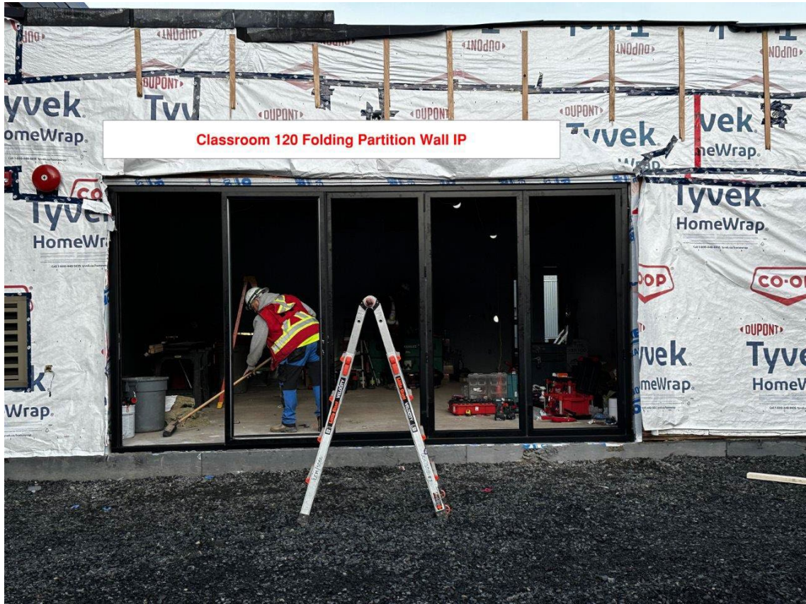
Classroom 120 Folding Partition Wall IP