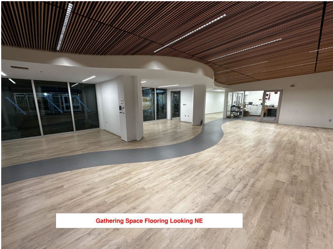
Gathering Space Flooring Looking NE