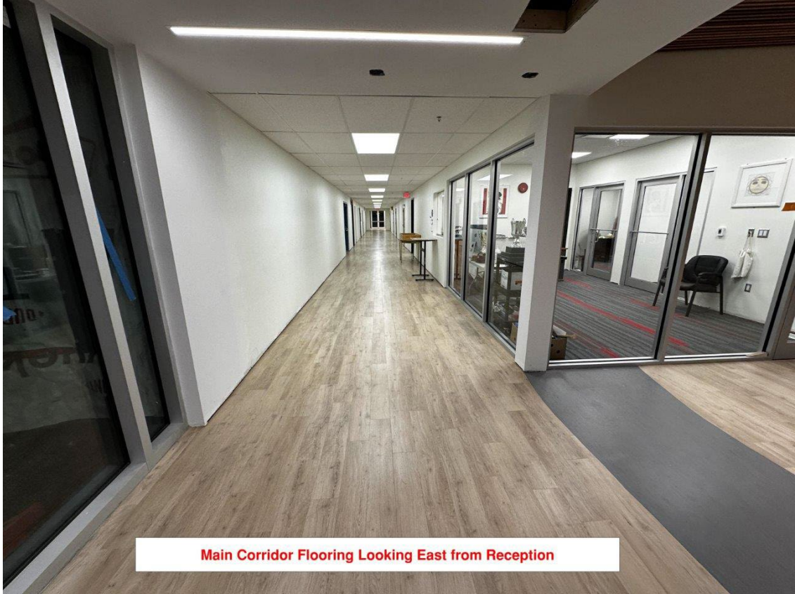
Main Corridor Flooring Looking East from Reception