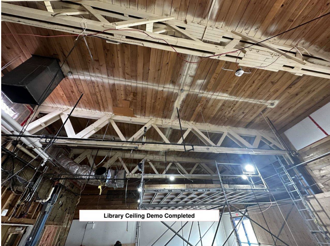
Library Ceiling Demo Completed