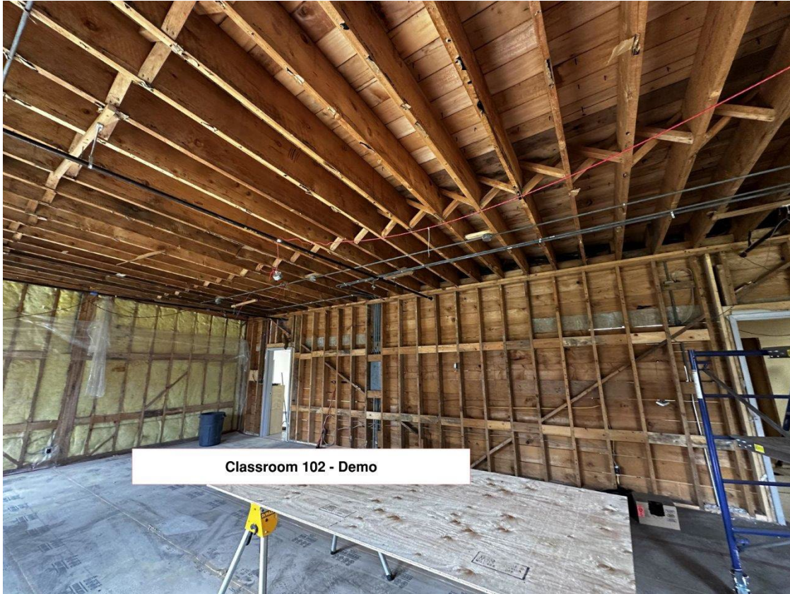
Classroom 102 - Demo