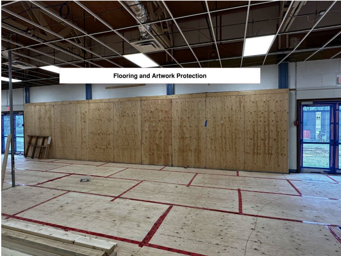
Flooring and Artwork Protection