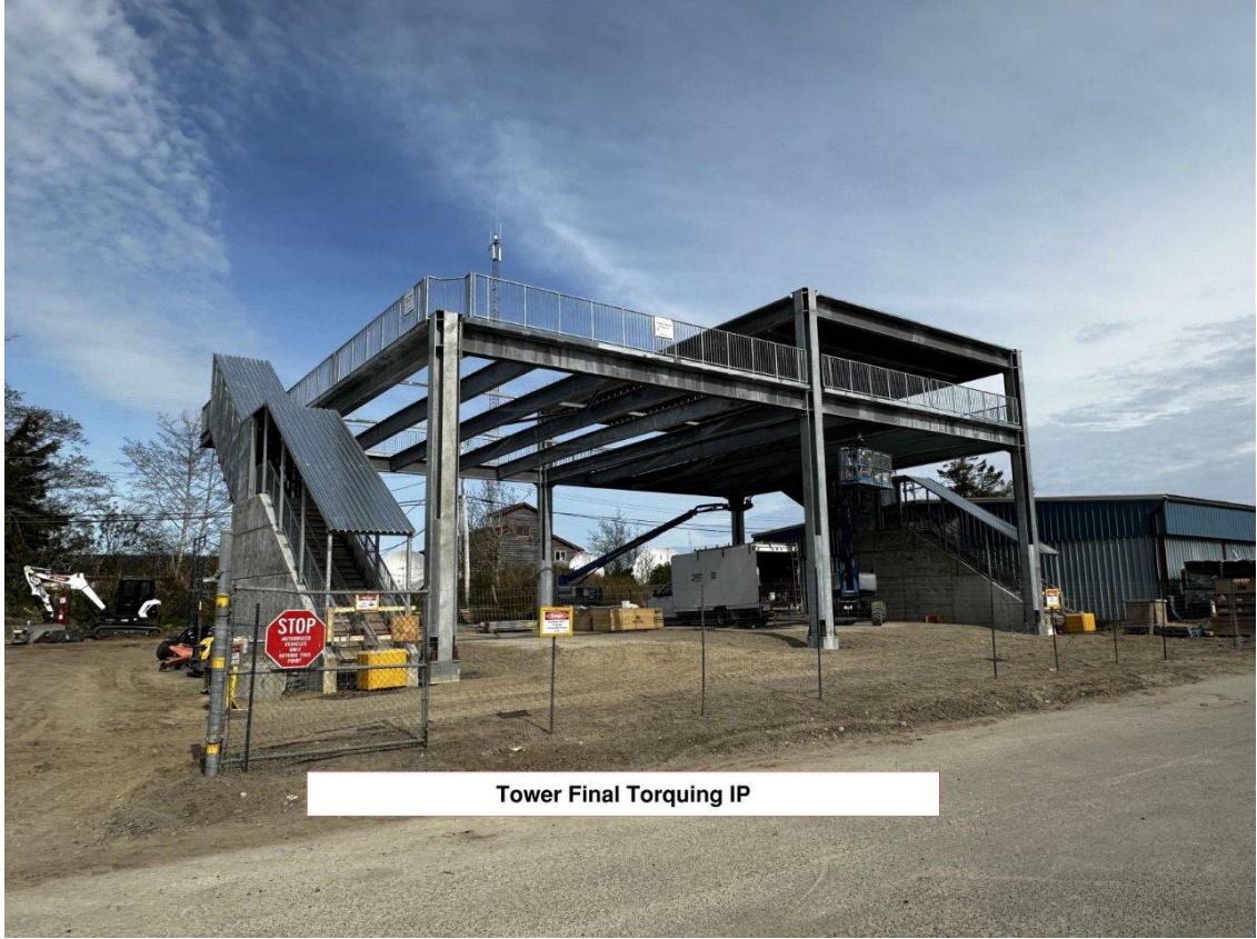
Tower Final Torquing IP