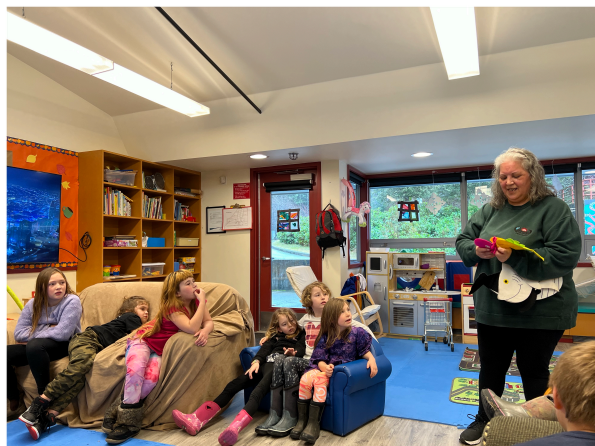
Visit to Language Nest February 2023