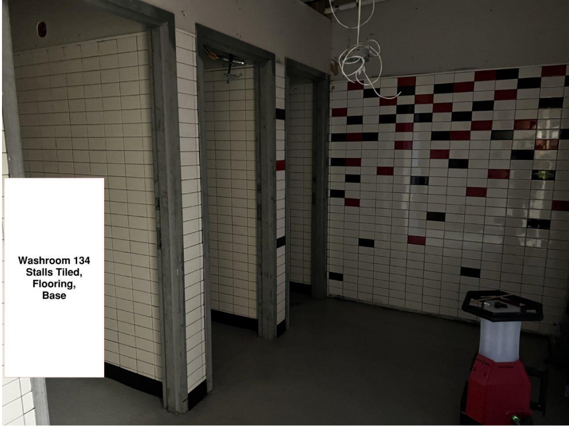
Washroom 134 Stalls Tiled, Flooring, Base