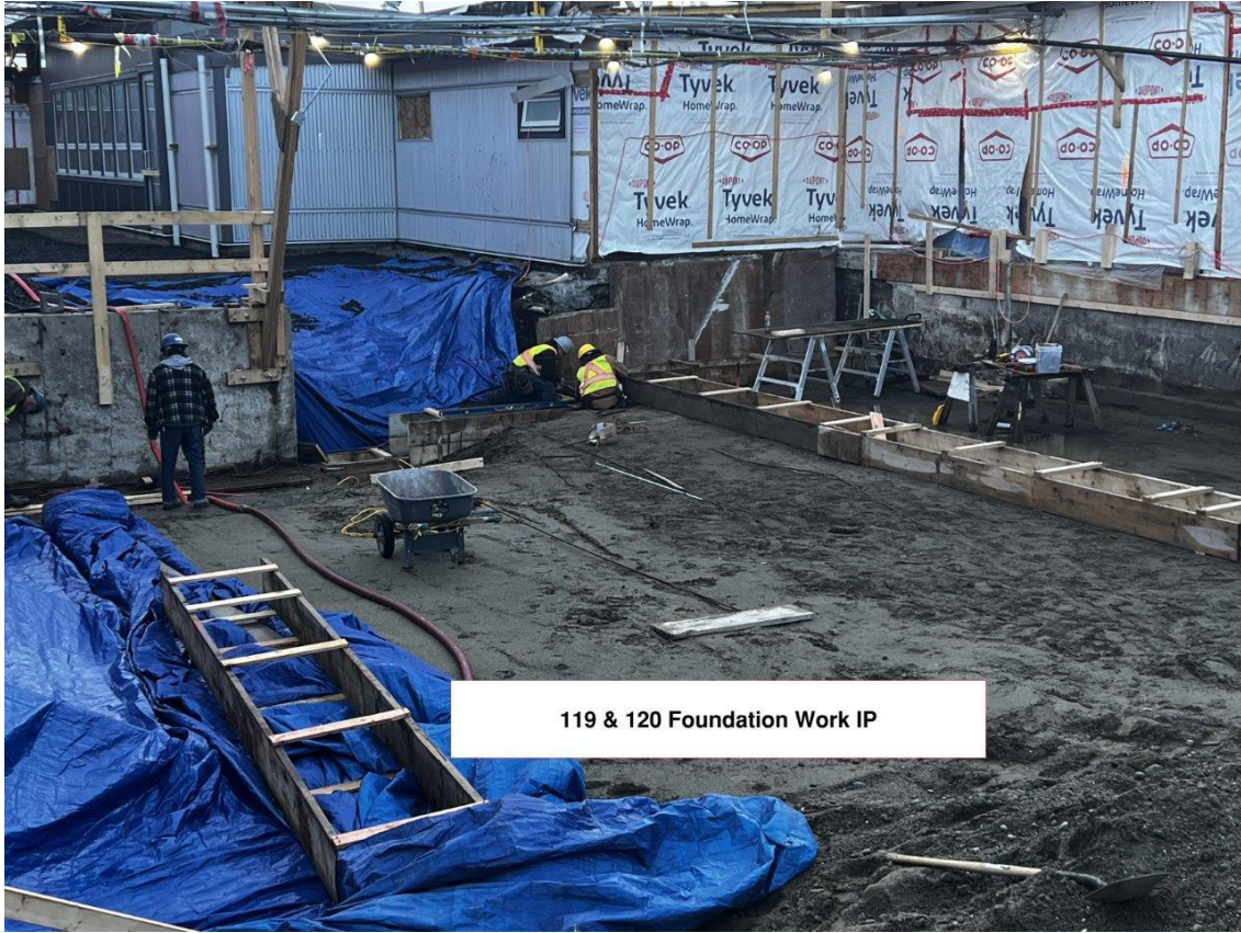
119 & 120 Foundation Work IP