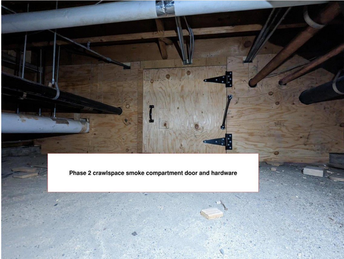
Phase 2 crawlspace smoke compartment door and hardware