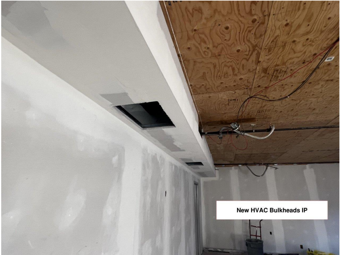
New HVAC Bulkheads IP