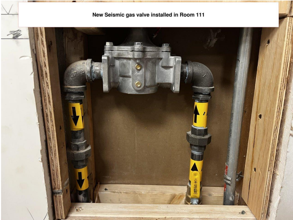
New Seismic gas valve installed in Room 111