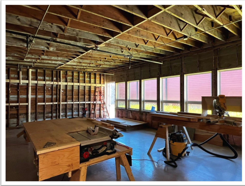
Figure 3 All seismic framing and blocking completed