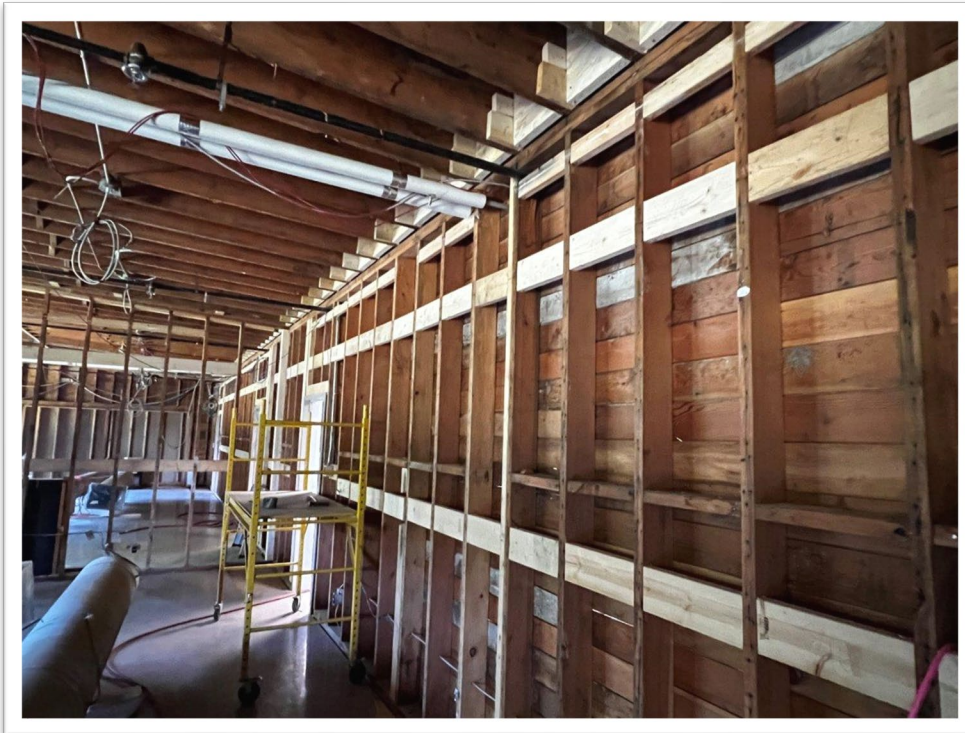
Figure 4 All seismic blocking and framing completed