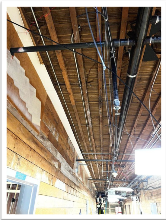
Figure 2 Heating lines in Phase 1 area removed