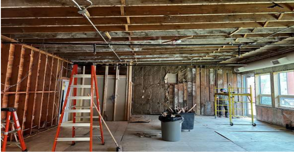
Figure 1 room 131