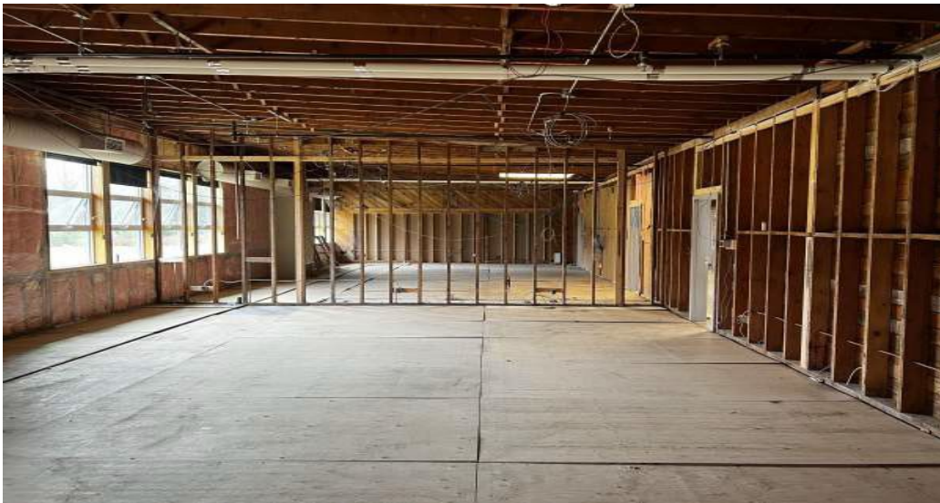
Figure 2 room 137 and 138