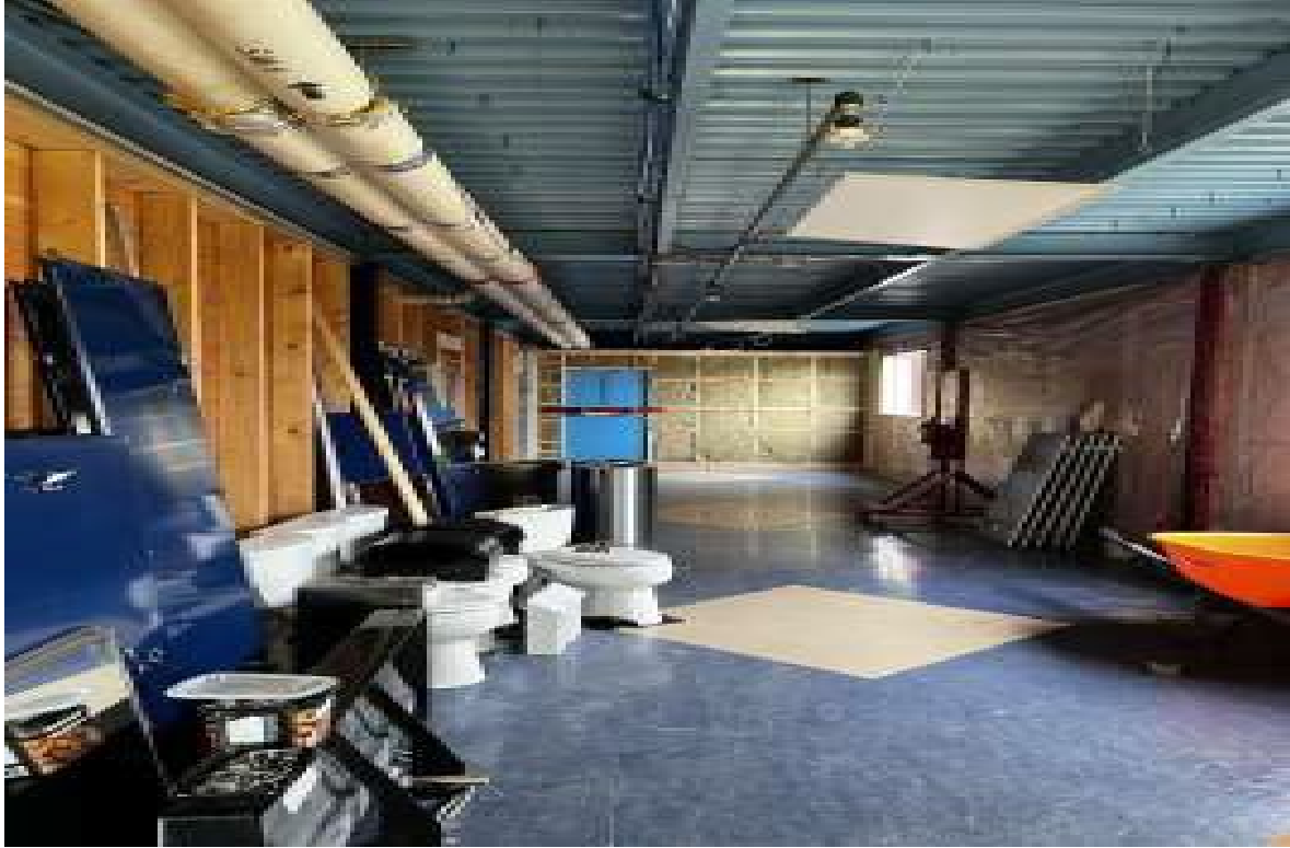
Figure 3 Common area