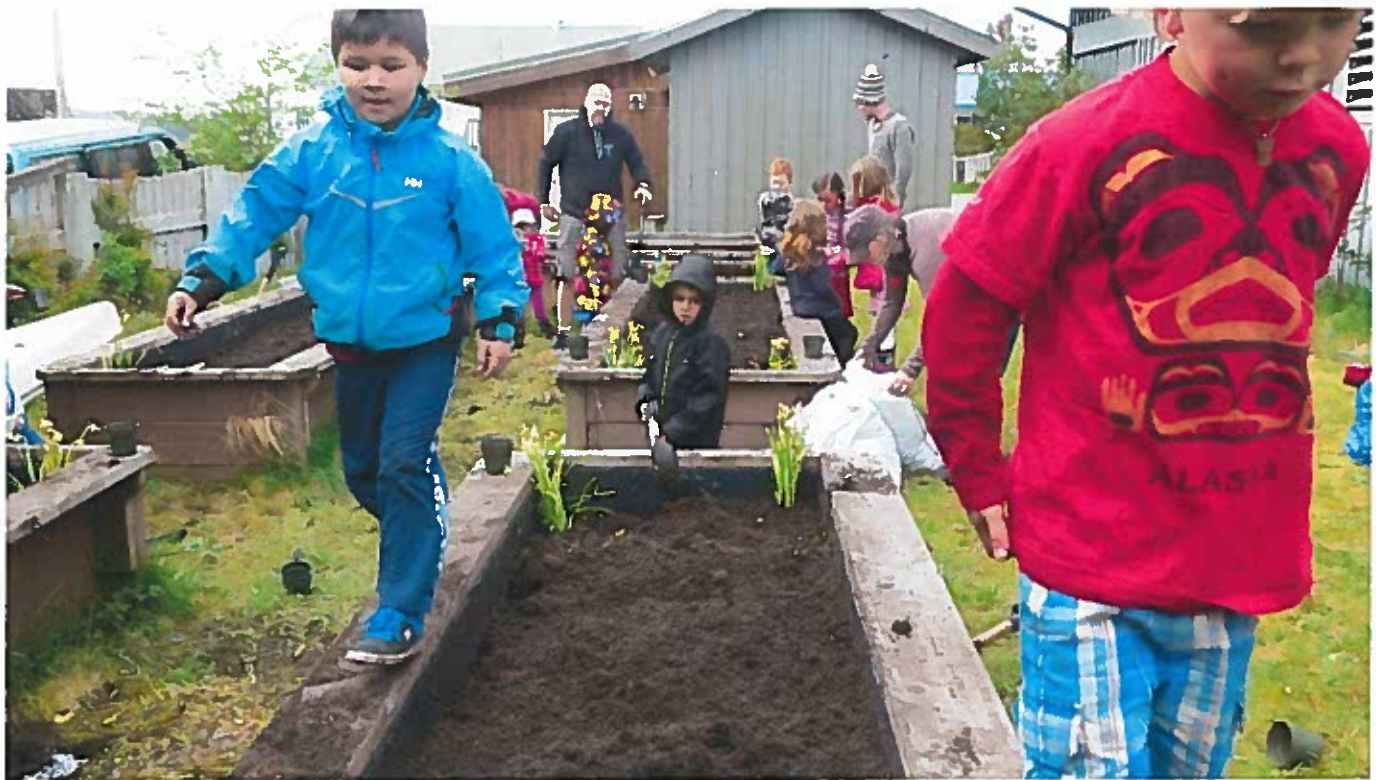
Students working on garden beds at Haida Health Centre.